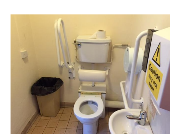
Above: Castle Hill accessible toilet