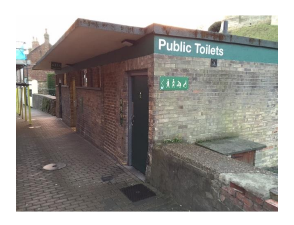
Above: Castle Hill accessible toilet