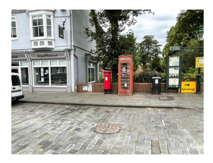
Above: Disabled parking bay by Elite on the Bail

There are two disabled parking bays on Bailgate, one by the Bailgate Methodist Church and one by Elite on the Bail (Fish and Chip restaurant & takeaway). (3 hours for Blue Badge holders) and several 1 hour parking spaces (all day parking for Blue Badge holders)